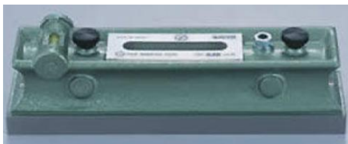
Figure 1: Water level gauge

Ensuring the accuracy and reliability of the Inline calibration is the task of the user. Bosch Sensortec cannot guarantee the accuracy of the modified parameters. Depending on the user's implementation and operation, there may be a loss of accuracy.